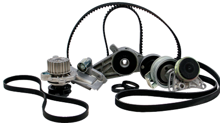
Solution Kits for Vehicles with Timing and Accessory Belts

Data available through Activant/Epicor, WHI, or ShowMeTheParts.com