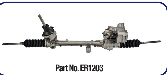
Part No. ER1203