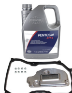
CRP Part No. 1058207-KIT-2