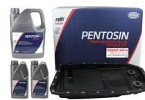
CRP Part No. 1058207-KIT-4