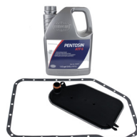
CRP Part No. 1058207-KIT-1

Multiple applications for ZF 6-speed transmissions For details, see showmethепarts.com/crp