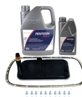
CRP Part No. 1058207-KIT-3