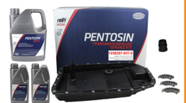
CRP Part No. 1058207-KIT-5

Kit contents have been updated from ATF 1 fluid to ATF 6 fluid. ATF 6 was specially developed with reduced viscosity to optimize the performance of specified 6-speed ZF automatic transmissions. Kits 1, 2, and 3 include recommended amount of fluid plus Rein OE quality filter kit. Kits 4 and 5 (for BMW) include recommended amount of fluid plus Rein oil pan with oil filter, sealing sleeves, and required number of bolts.