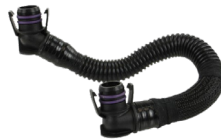
Part No. CHH0818

Multiple applications for Tesla For details, see showmetheparts.com/crp