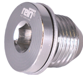
CRP Part No. HWU0098