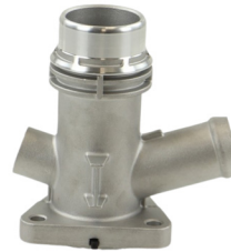
Part No. CHU0940 (connector & gasket)

Multiple applications for BMW B58 6 Cyl. 3.0L engines For details, see showmetheparts.com/crp