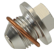
Part No. HWU0113