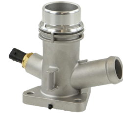
Part No. CHK0940 (connector & gasket with temperature sensor)

Constructed with aluminum as a durable upgrade to the failure-prone plastic OE connector. Resists cracking, brittleness, and hydrolysis for longer service life and reduced maintenance. Available in two versions: CH0940 includes connector and gasket, and CHK0940 with added temperature sensor for easy installation.