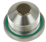
Part No. HWU0065

14 SKUs featuring aluminum construction with a flush tip magnet for an upgraded alternative to OE plug. Captive magnet attracts ferrous wear particles that bypassed the filter to prevent recirculation. Designed for precise fit and proper sealing; includes a single-use crush washer (HWU0065 has embedded O-ring).