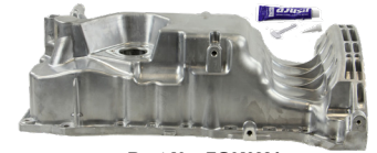
Part No. ESK0234