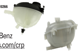
Part No. EPT0266

Multiple applications for Audi, Volkswagen, & Mercedes-Benz For details, see showmetheparts.com/crp