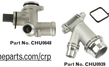
Part No. CHU0648

Multiple applications for BMW & Audi For details, see showmetheparts.com/crp