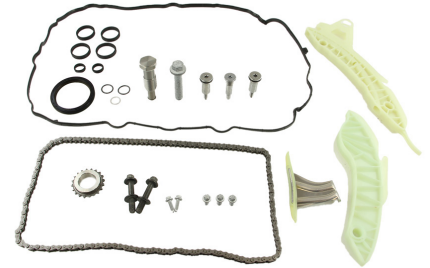
Part No. CKS0251

Multiple applications for MINI N12, N14, N16, N18 4-Cyl. engines For details, see showmetheparts.com/crp