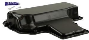
Part No. ESK0232