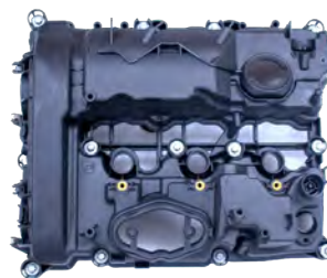
Part No. VCE0111

VCE0111 applications for Mini Cooper B36 & B38 3 Cyl. 1.5L engines VCE0112 applications for Mini Cooper N18 4 Cyl. 1.6L engines For details, see showmetheparts.com/crp