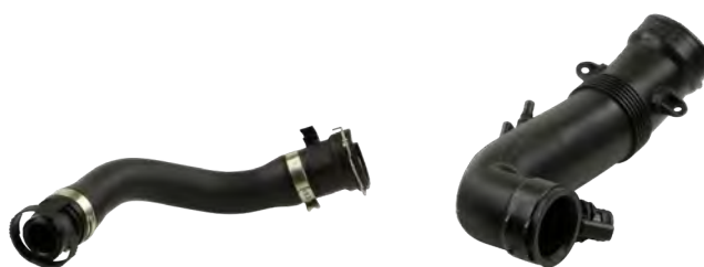
Part No. ABV0357