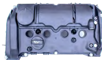
Part No. VCE0112

Designed to be direct-fit replacements for OE units. Supplied with installation hardware, integrated breather valve, and high quality gasket to prevent leaks. Manufactured with high quality materials for optimal fit and function.