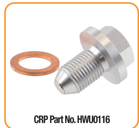
CRP Part No. HWU0116